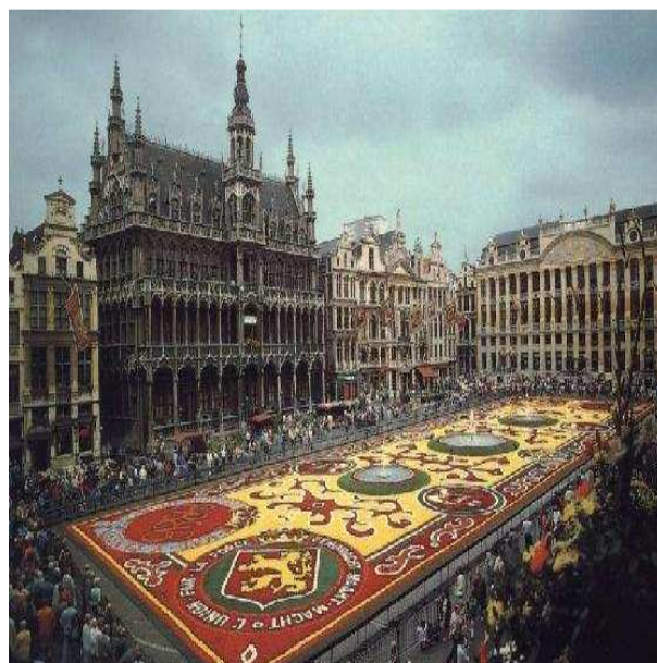
The Grand Place in Brussels; the next EuSEN meeting will be in Brussels, October 28 & 29 2011

Fees paid before the October meeting in Brussels will entitle that organisation to a voting place at the meeting