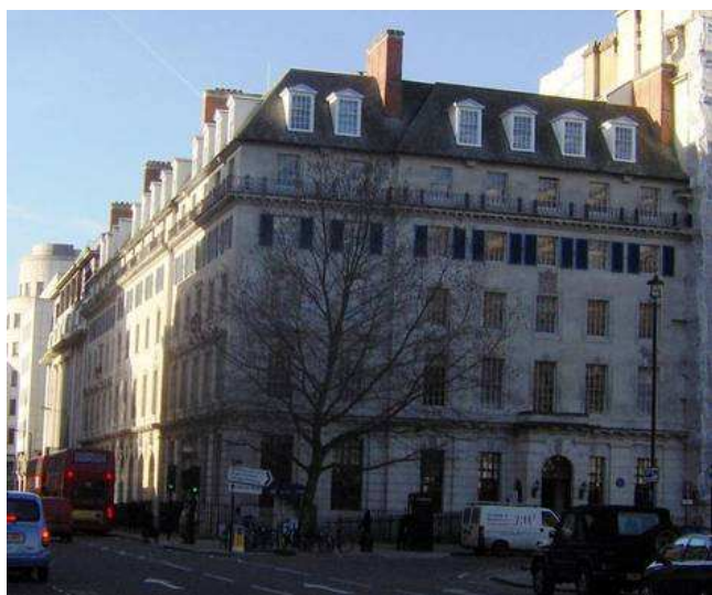
Royal College of Nursing Headquarters in London where the April meeting was held

Delegates at the meeting discussed how EuSEN could generate some money in order to begin some of the activities it wants to undertake including development of a website and funding of future meetings and conferences